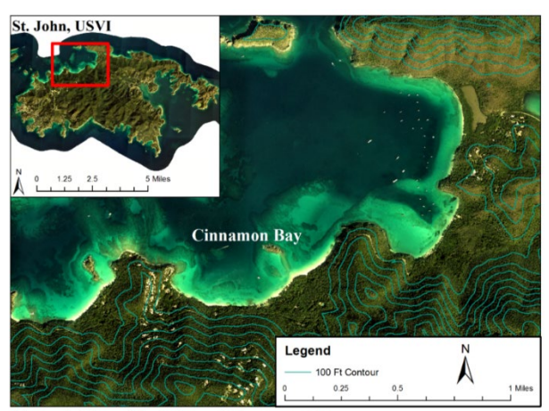
Figure 4: Map of St. John and Cinnamon Bay

eastern half compared to a western half that shows evidence of frequent flooding caused by events from land and sea (Sleight, 1962:19). The sand dune bar, typical of most bay environments, runs parallel to the shoreline and likely formed from a combination of wind and fluvial processes. The structure of this feature indicates it has "moved, broken, and reformed many times" (Sleight, 1962:19).