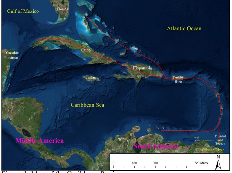
Figure 1. Map of the Caribbean Region

The Caribbean region is often further organized into three smaller groupings: the Greater Antilles, the Lesser Antilles and the Bahama (or Lucayan) Archipelago (Rouse, 1992:3). However, Keegan et al. (2013) identify five distinct archipelagoes (or island groups) (Figure 2). These authors identify two additional distinct regions based on the "geographical proximity, island size, and maximum elevation" between the various islands (Keegan et al., 2013:3). The two additional regions are labeled the "Southern Caribbean Region" and "Trinidad and Tobago" (Keegan et al., 2013:5).