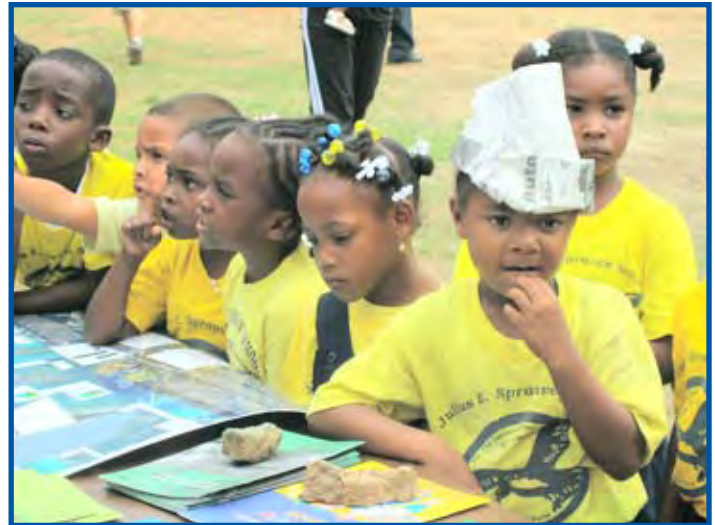
Earth Day Fair attendees.